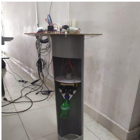
Fig 2: Hard ware Implementation

operations by transmitting location and status data to authorities, improving response speed and safety.